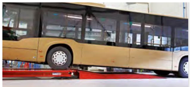
Versatile modular drive-on ramps