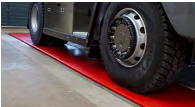
Flush with the floor and ideal for low-clearance vehicles

Flush mounted, semi-flush mounted, or surface mounted – each model is possible with the SKYLIFT. This heavy duty vehicle lift is suitable for a wide range of vehicles and workshop situations.