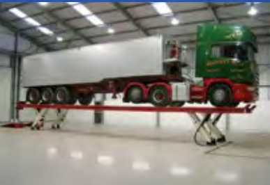
Completely vertical lifting operation

Stertil-Koni provides a complete range of heavy duty vehicle lifts and lifting equipment for customers all over the world. All Stertil-Koni vehicle lifts are designed and manufactured in-house by a team of specialists with expertise in the heavy duty vehicle lifting industry. Stertil-Koni is represented across the globe by local sales organizations, exclusive Stertil-Koni distributors, and a network of qualified Stertil-Koni Service partners. This makes Stertil-Koni the Number 1 in heavy duty vehicle lifting around the world.