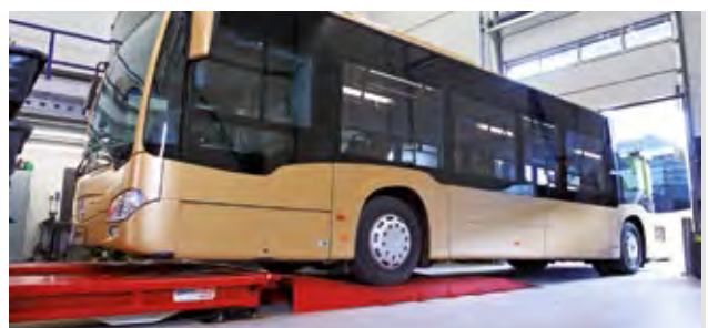
Fixed end-stops or "drive-thru" versions