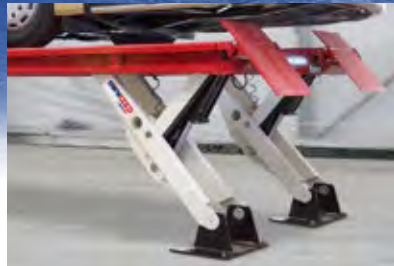
Easy access Y-shaped construction