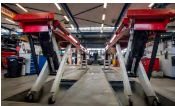
Automatic Recess Cover Plates