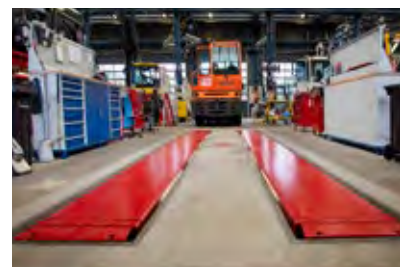
Flush mounted with Reverse Roll-Off

Safety is one of Stertil-Koni's top priorities. The automatic Reverse Roll-Off Protection System with optimum safety prevents the vehicle from inadvertently rolling-off the lift. This system also effectively lengthens the platform lengths compared to conventional platform lifts. This option is available for all SKYLIFT models and can be fitted to existing installations.