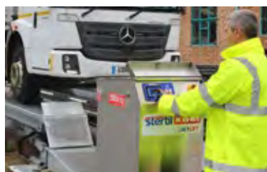
Stainless steel control console