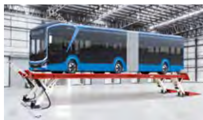
Platform lengths up to 48 feet