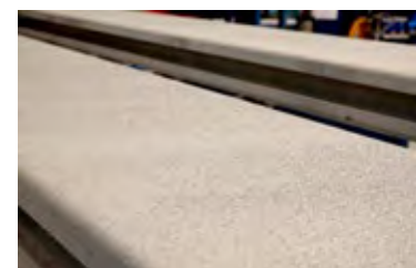
Steril® Guard™ Anti-Skid Coating