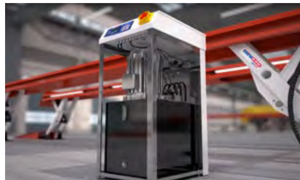
Removable side panels for easy maintenance