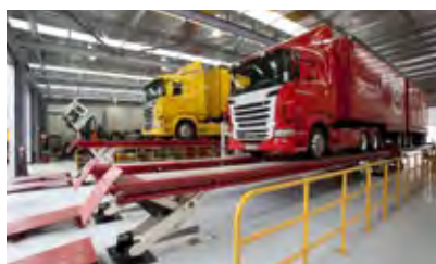
Various platform lengths

With a special synchronization set and a bridging-piece between the two lifts, it is possible to use two SKYLIFT vehicle lifts safely and quickly as either a single long lift or simply as two individual lifts. The drive-on is just as safe and equally smooth as with a single configuration. This is due to the minimal amount of space between the two lifts.