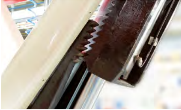
Mechanical Locking System

The mechanic can work ergonomically and safely standing upright under the vehicle. A toolbox trolley and other workshop equipment can easily be moved under the platforms.