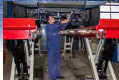
Maximum vehicle access