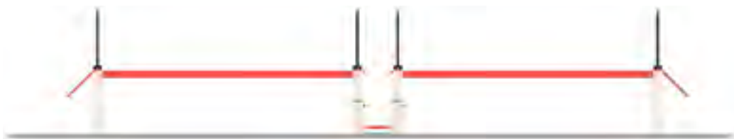
Tandem configuration, side view

ST 4120 can be extended in a tandem configuration with two lifts in line that can be operated individually or together. It's perfect for long buses or other longer combinations.