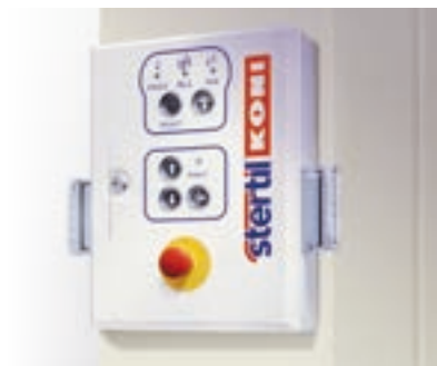
Superior control for cabled version